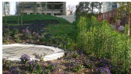
Close-up of the vegetation on top of the underground parking.