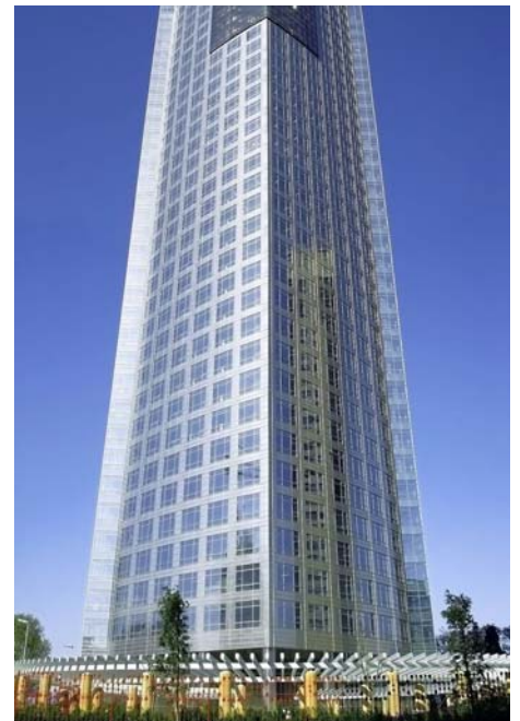
The 525 ft. (160 m) high tower rises in the sky.