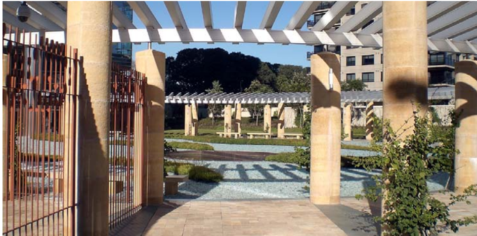
The roof garden on top of the underground parking in front of the Torre YPF, Buenos Aires.