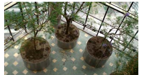
Planter boxes behind the glass facade.