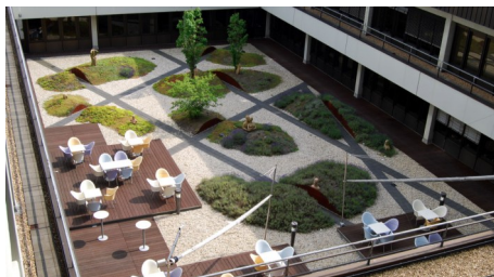
The large courtyard was provided with a wooden deck and seating-accommodations for the employees.