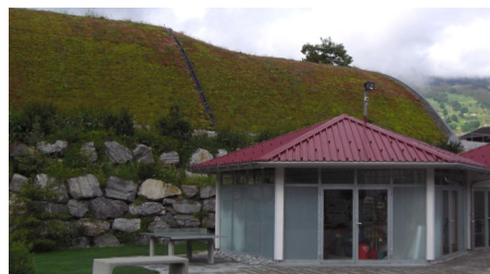
The rear of the fire station, taken from the new outdoor pool.