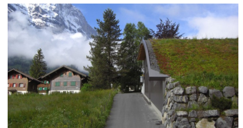
The road sloping slightly upwards to the fire station.