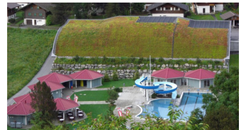
The collectors for warm water can be seen at the top right of the extensive green roof.