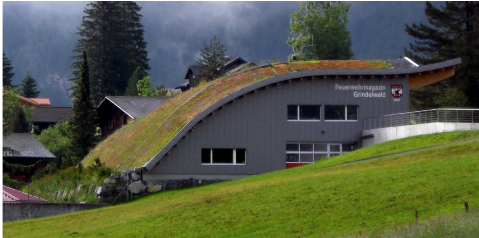
The Grindelwald fire station merges beautifully with the surrounding mountainside.