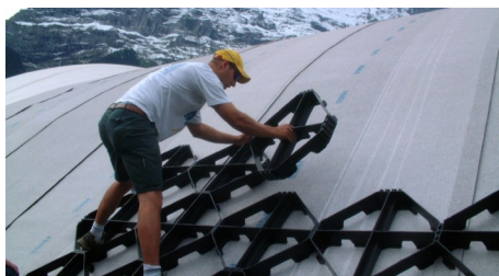
The Georaster® elements are installed from the bottom up. In the background, the legendary Eiger North Face.