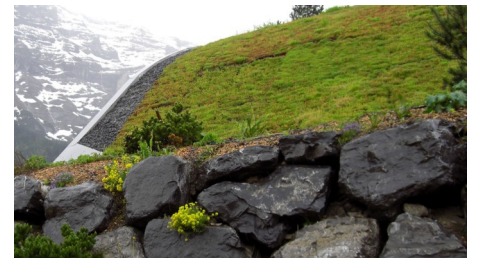
The sloped roof with newly-installed pre-cultivated vegetation mats.

Pre-cultivated vegetation mats, each 22 sq. ft. (2 m 2 ) in size, were placed above the growing media for quick surface coverage and immediate protection against erosion. Flat-plate solar collectors were fitted along parts of the roof ridge in order to generate warm water for the adjacent outdoor swimming pool.