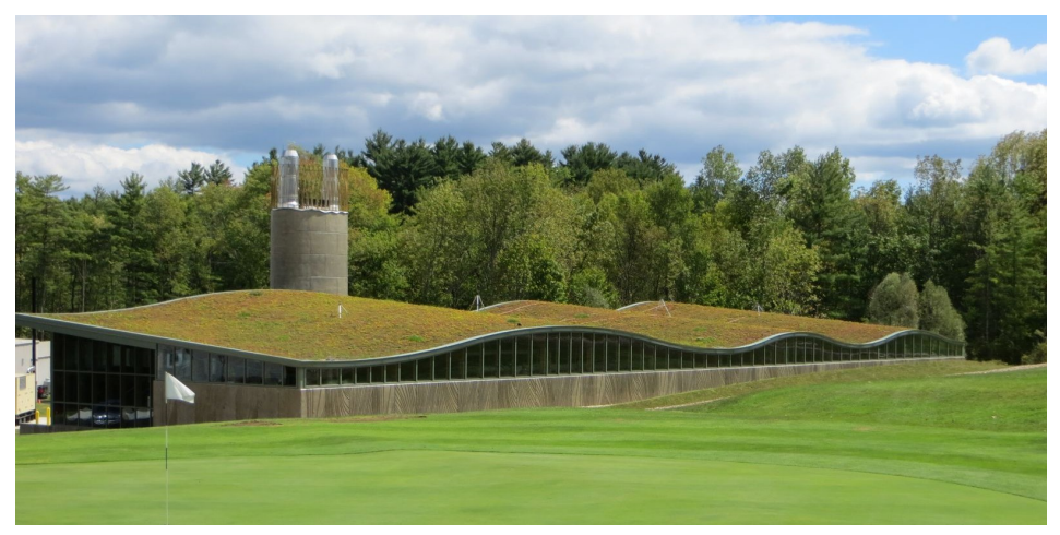
The undulating sloped green roof merges the building beautifully with the surrounding landscape.