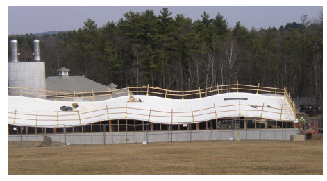
Before the green roof work started, a root resistant waterproofing made by Sika Sarnafil was installed.