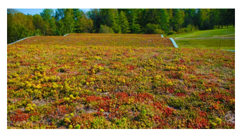
Just three months after completion the plants already had thriven splendidly.

Treatment Center is a LEED Gold certified building, that provides heating for the Hotchkiss School's campus buildings. According to the architect, the facility is part of Hotchkiss commitment to becoming a CO_2 -neutral campus by 2020. The building merges with the surrounding landscape in an excellent way, due to the low profile and an undulating sloped green roof.