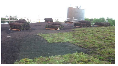
The precultivated vegetation mats were laid butt joints directly onto the green roof substrate.