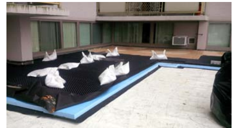
The roof of the building was built as an inverted roof.