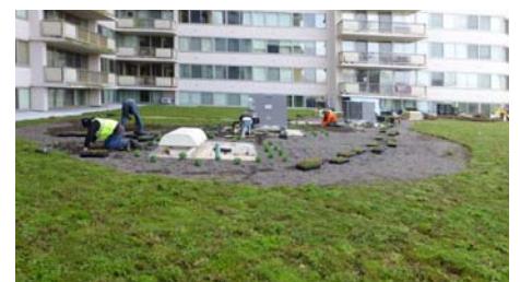
Most of the roof area was planted with pre-cultivated plant mats to achieve an immediate green effect. In the area around the technical installations different higher-growing grasses were planted.