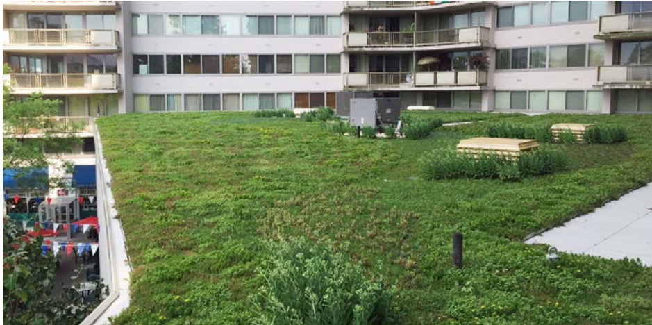
Besides the reduction of water runoff, the green roof also enhances the visual appearance of the surface.