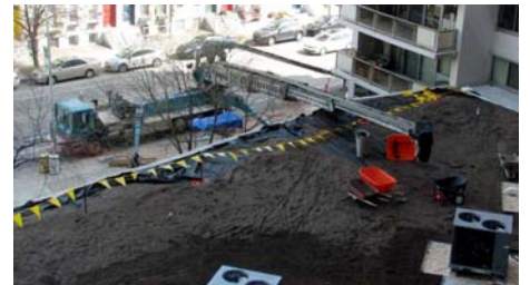
The substrate was transported to the roof via a telescopic conveyor belt (Telebelt).