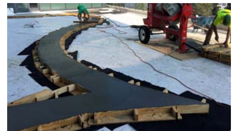
Floradrain® FD 40-E was used as a permanent formwork for the curb and seatwalls.