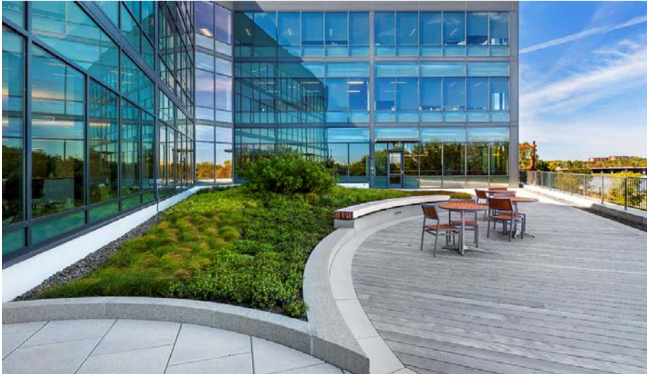
The rooftop offers spectacular views of the Mystic River.