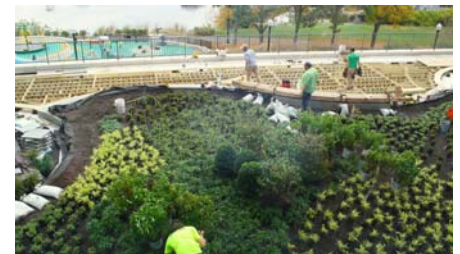
Floradrain® FD 40-E is the core element of the vegetated areas providing the plants with an optimal water-/air balance.