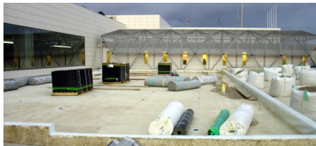
Protection mat, drainage elements and filter sheet are ready for installation.