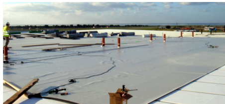
Preliminary work on the roof area to be vegetated.