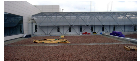
The roof area just after the application of substrate with Big Bags.