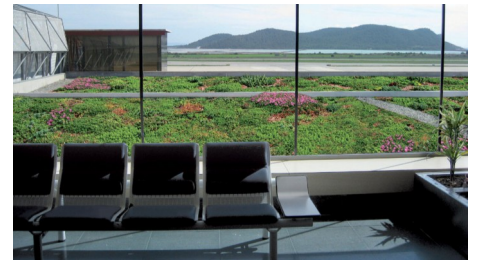
View from the waiting hall to the large-scale planting.