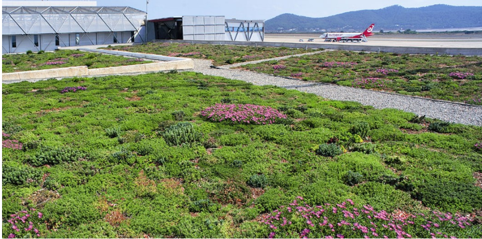
Partial view of the large-scale extensive planting.