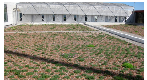
The roof area a few months after the plug plants have been planted.