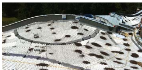
The roof of the visitor center shortly after the installation of the Floraset® FS 75 elements.