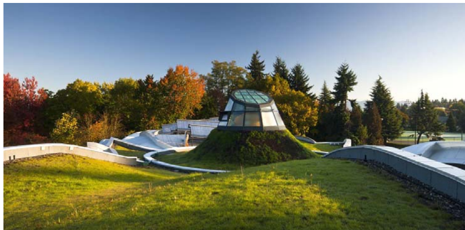
The green roof of the new visitor center at the opening ceremony in October 2011.

Coordinates: 49°14'22.60"N 123° 7'44.12"W