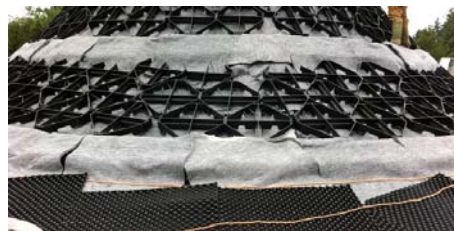
The Floradrain® elements adjacent to the sloped roof area where Georaster® was applied.