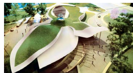
The architect's model shows the shape of orchid leaves;

Protection Mat Roof construction with root resistant waterproofing