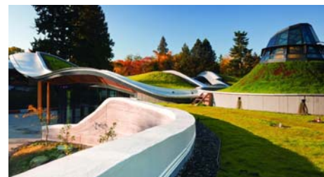
This photograph made in October 2011 shows the lawn that already had developed well.

The visitor center has already been awarded the LEED Platinum Status for environmentally friendly and sustainable constructions.