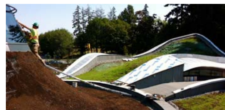
Shortly before completion of the roof surfaces.