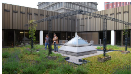
In the small courtyard planters with trellises were provided for various climbers.