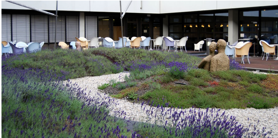
The large courtyard was furnished with art objects surrounded by lavender and shrubs.