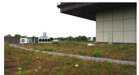
The flowering roof area in the summer of 2010, about four years after the installation of the green roof.