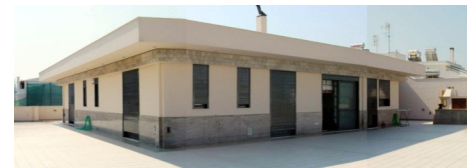
The terrace before reconstruction...