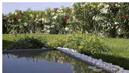
Two years later, the lawn and the rhododendron have established well.