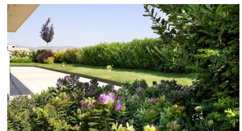
A metal profile separates the terrace from the rest of the roof.