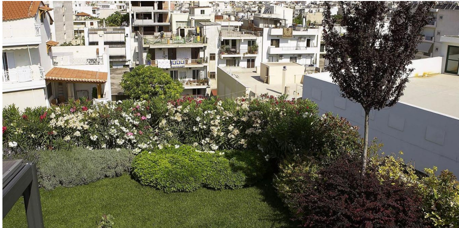
The roof garden is a green island in the densely built urban landscape.