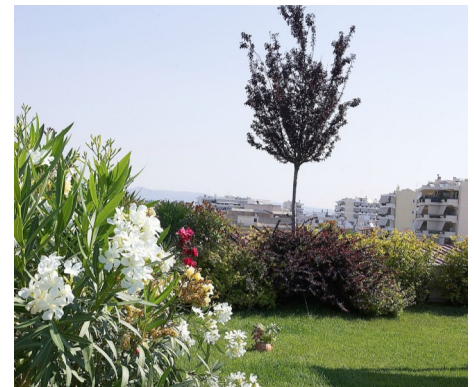
The roof garden was planted with lawn, shrubs and trees.