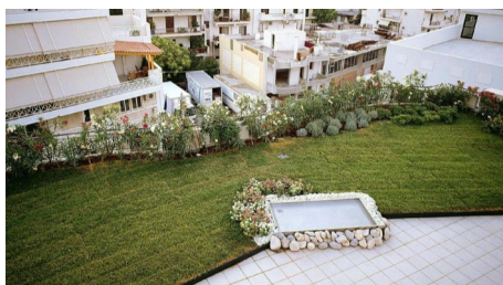
The roof garden shortly after completion in 2003.