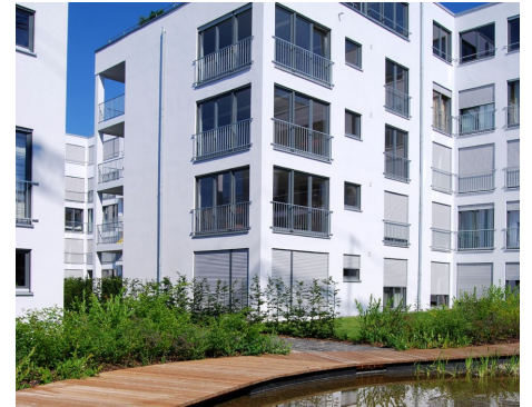
A man-made creek flows into this pond.