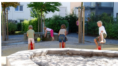
A playground with a sandbox is part of the "Blue Garden".