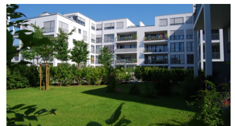
The recently planted trees are still relatively small.