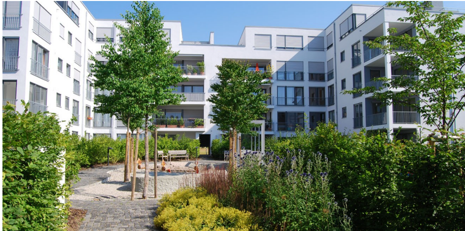
Part of the "Blue Garden" in the Scharnhäuser Park, Ostfildern.