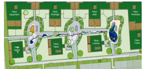
The preliminary design of the landscape architect

Area: ca. 15,100 sq. ft. (1,400 m 2 ) Construction time: 2006 until 2009 Landscape architect: Frank Roser, Ostfildern Contractor: Landscaping Ulrich Schweizer, Nürtingen System build-up: "Roof Garden" with Floradrain® FD 60 Coordinates: 48°43'14.10"N 9°16'01.30"E