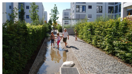
Children love to play at the artificial creek.