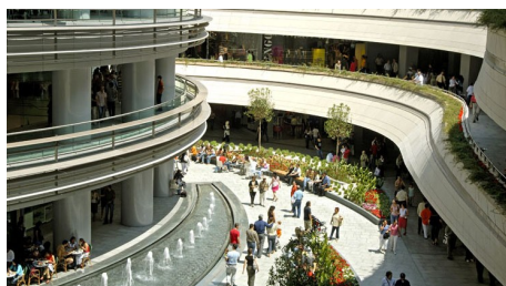
The Kanyon Levent Centre - an experience for fans of shopping, gourmet and lifestyle.