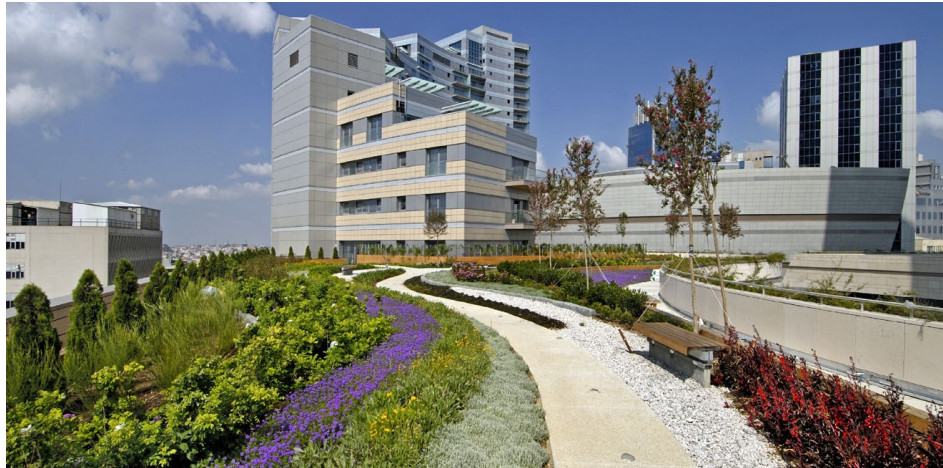
The Kanyon Shopping Centre is located in the business district of Istanbul.