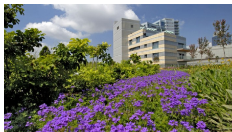
A colorful blooming landscaped roof in the heart of a million-metropole.