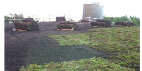
The precultivated vegetation mats were laid butt joints directly onto the green roof substrate.