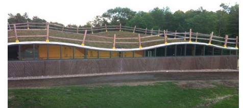
Shortly after completion: The "Biomass Treatment Center" with its green roof.