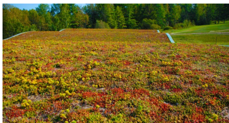
Just three months after completion the plants already had thrived splendidly.