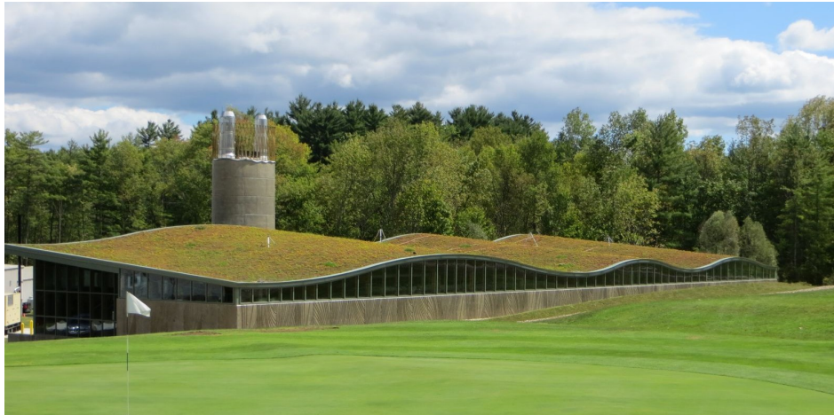
The undulating sloped green roof merges the building beautifully with the surrounding landscape.