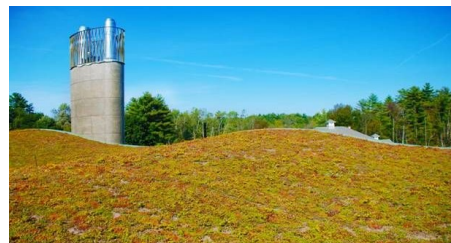
Due to the use of precultivated sedum mats, the roof was covered by vegetation quickly.