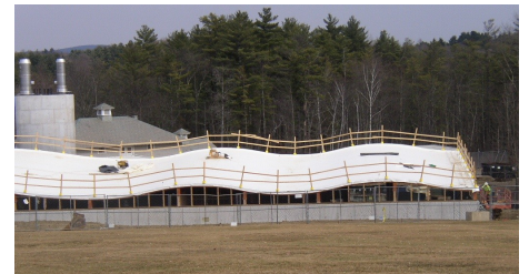
Before the green roof work started, a root resistant waterproofing made by Sika Sarnafil was installed.