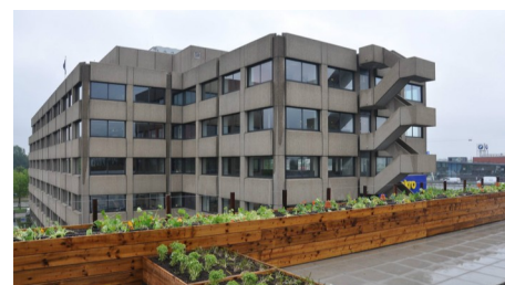
The green roof can be seen perfectly from the offices of the higher opposing building - a welcome change in an area predominated by industrial buildings.