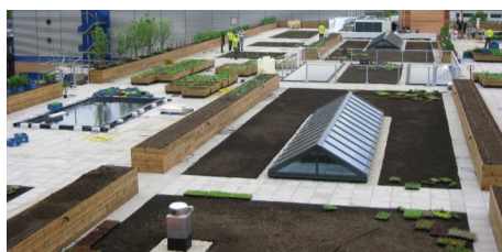
The system build-up "Sedum Carpet" with Fixodrain® XD 20 was applied between the skylights ...