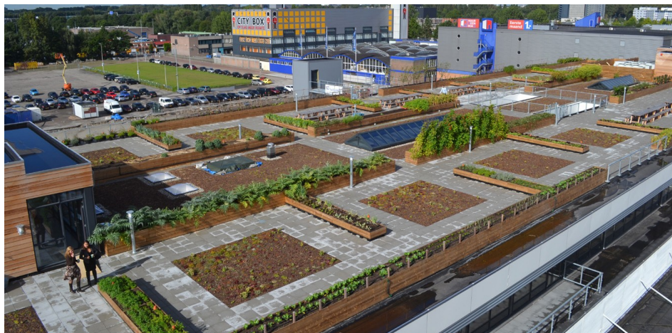
The rooftop farm of Zuidpark can be used for both, for lunch and for corporate events.