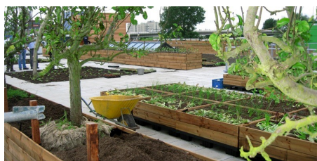
... whereas the build-up "Urban Rooftop Farming" including FD 40-E was applied on the raised plant-bed.