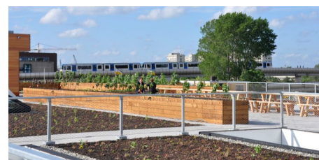
In the foreground: The areas with extensive green roof vegetation shortly after completion .