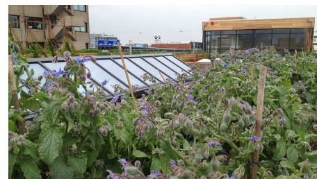
Even herbs, such as the beautifully flowering borage are grown in the small vegetable gardens of the rooftop farm.