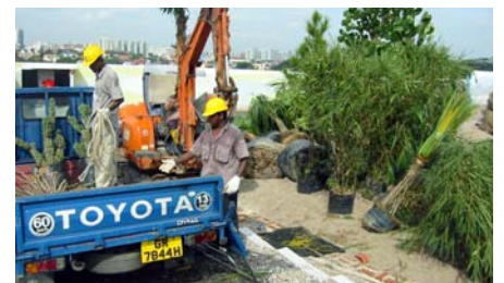
Local palm trees were planted in a 1,20 m deep substrate layer.